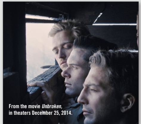
From the movie Unbroken , in theaters December 25, 2014.

Brainstorm how you would escape the situation using the different skills in your group. You must have a written plan before the buzzer sounds. Elect a spokesperson for the group to share your survival plan with the class!