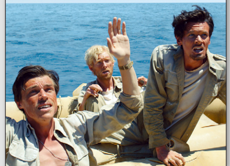
From the movie Unbroken , in theaters December 25, 2014.

INSTRUCTIONS: In designated teams, get your “dangerous assignment” from your teacher and write it below. This situation will test your survival skills. You will have 15 minutes to get to know your teammates and to develop a plan. The clock is ticking!